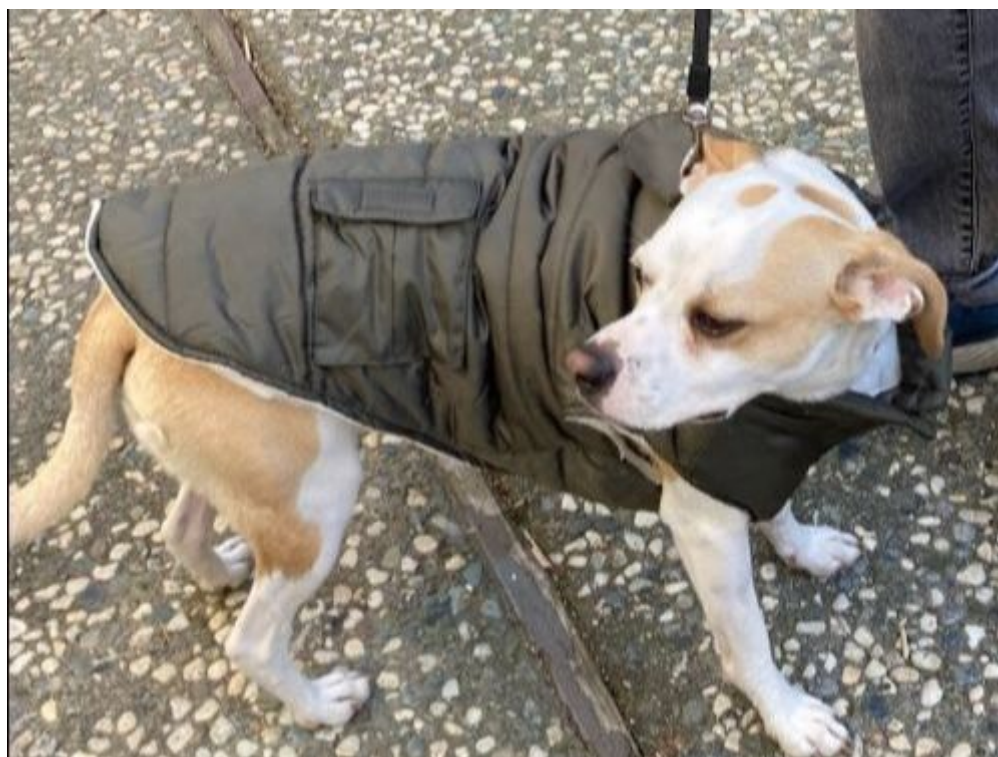
Our own Ohlone Humane Society Dog, Emme, modeling one of the winter coats donated for our Warm Stuff Drive.