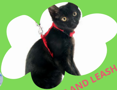
HARNESS AND LEASH