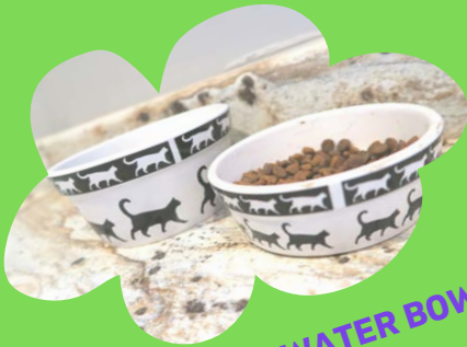
FOOD AND WATER BOWLS