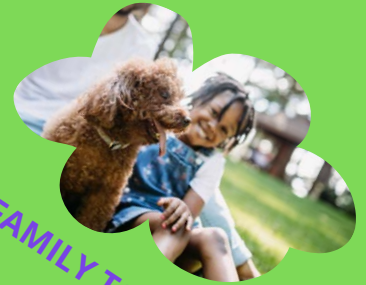
FAMILY TO LOVE