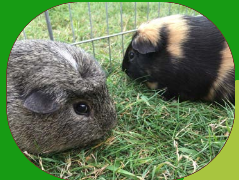
ASSORTED FRESH HAY, GUINEA PIG PELLETS, CERTAIN FRESH PRODUCE