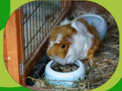
LARGE WIDE ONE-LEVEL CRATE AND SOFT BEDDING