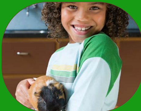
A FAMILY TO LOVE