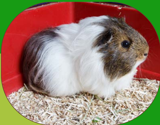
LITTER OPTIONS - PAPER, FABRICS, OTHER