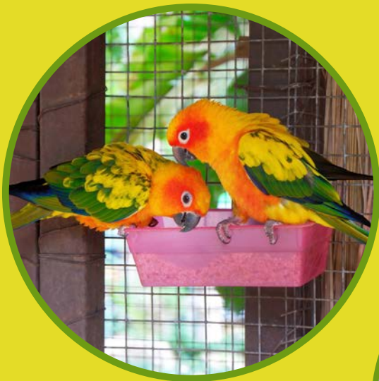
Food Cups with Proper Diet