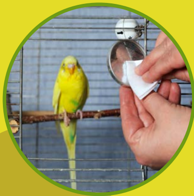
Clean mirrors and colorful toys