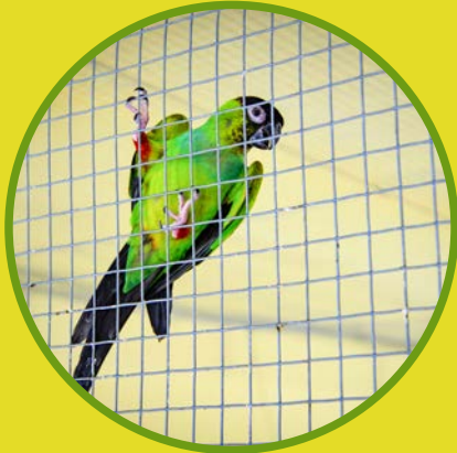
Cage with space