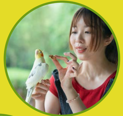
Family to Love