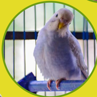
Perch or shelves