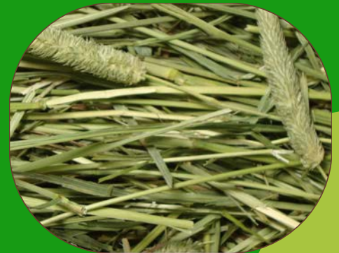
TIMOTHY HAY, PELLETS, CERTAIN FRESH PRODUCE