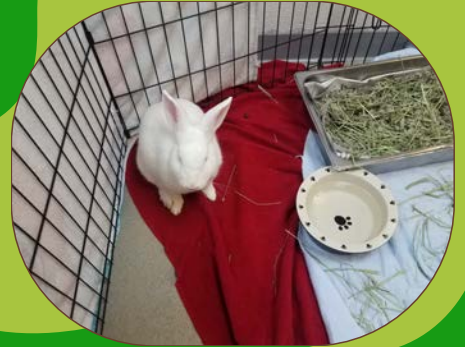
HUTCH/CRATE AND BEDDING