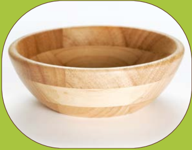
FOOD AND WATER BOWLS