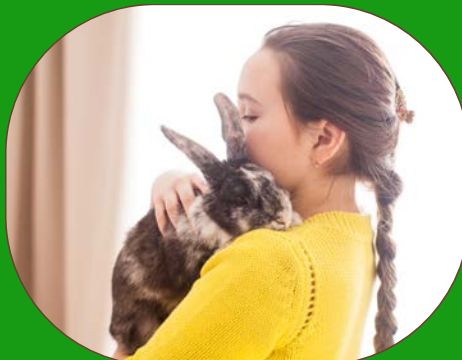
A FAMILY TO LOVE